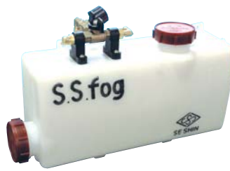
Drug tank, polyethylene, capacity:5.5 ℓ SS 150F/U