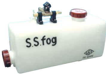
Drug tank, polyethylene, capacity:7.5 ℓ SS 180F/U