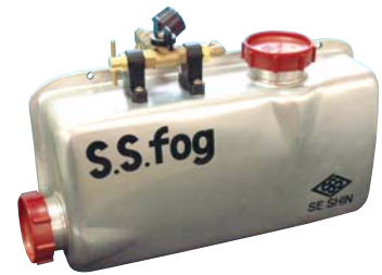
Drug tank, stainless steel, capacity:6.5 ℓ SS 150F/U